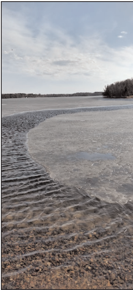
Ice clearing out on Clear Lake, Spring '22